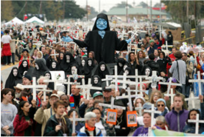
Marchers carrying crosses inscribed with the names of the victims of the graduates of the SOA